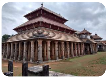
THOUSAND PILLAR TEMPLE