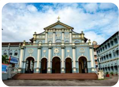
ST. ALOYSIUS CHAPEL